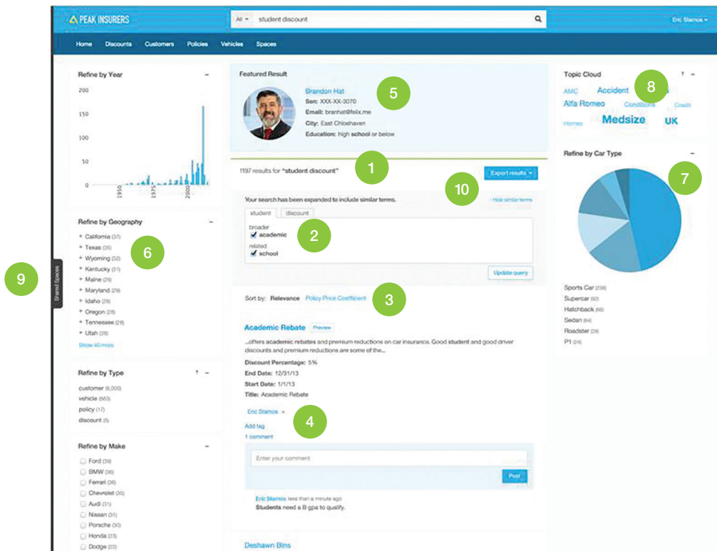
Figure 2: Typical user experience